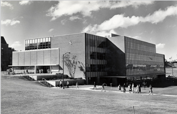
An exterior view of the completed U of I Library building in 1957. At the time of its completion, the library was one of the largest buildings on campus at 205 feet long, 138 feet wide and 89,606 square feet.