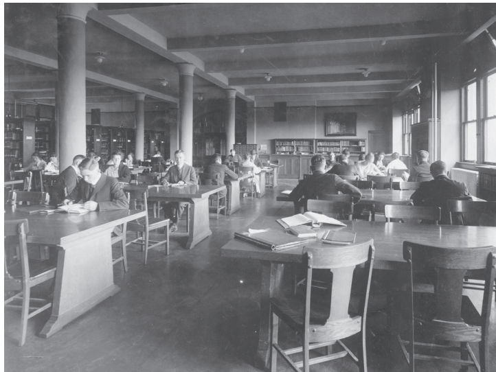
Library reading room, 1917. #1-201-2.

The ascendancy of the internet and the availability of so many things on the World Wide Web have for some years seemed to threaten the existence of books, and by extension, libraries. In California, where they are building new universities to meet the state's growing need for an educated work force, it was thought, even a decade ago, that electronic resources would make libraries unneces-