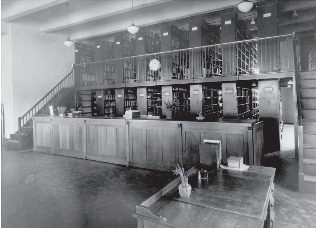
Circulation desk, 1922.

when they ask you what you think of the latest John Grisham or Stephen King, as if the bestseller list were actually a guide to the best in contemporary fiction. Worse yet: when the same people haven't heard of any of the titles or authors you've actually reviewed recently. The pits: when you realize that nearly everything you care about is irrelevant or utterly unimportant to most of the people who open the Washington Post .