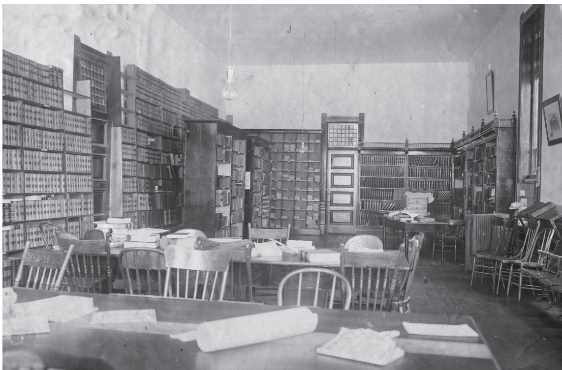
Original library, 1892-1906.

become that still rare phenomenon of a book-town. There are a couple in France; Larry McMurtry's in Archer City, Texas (now apparently closing); and Nevada City and Grass Valley, California, two small towns about halfway between Reno and Sacramento; and Wigtown, Scotland. First, and pre-eminent is Hay-on-Wye. Others are opening up, hoping to match the effect: economic development through cheap rents in small town coupled with lots of books for sale.