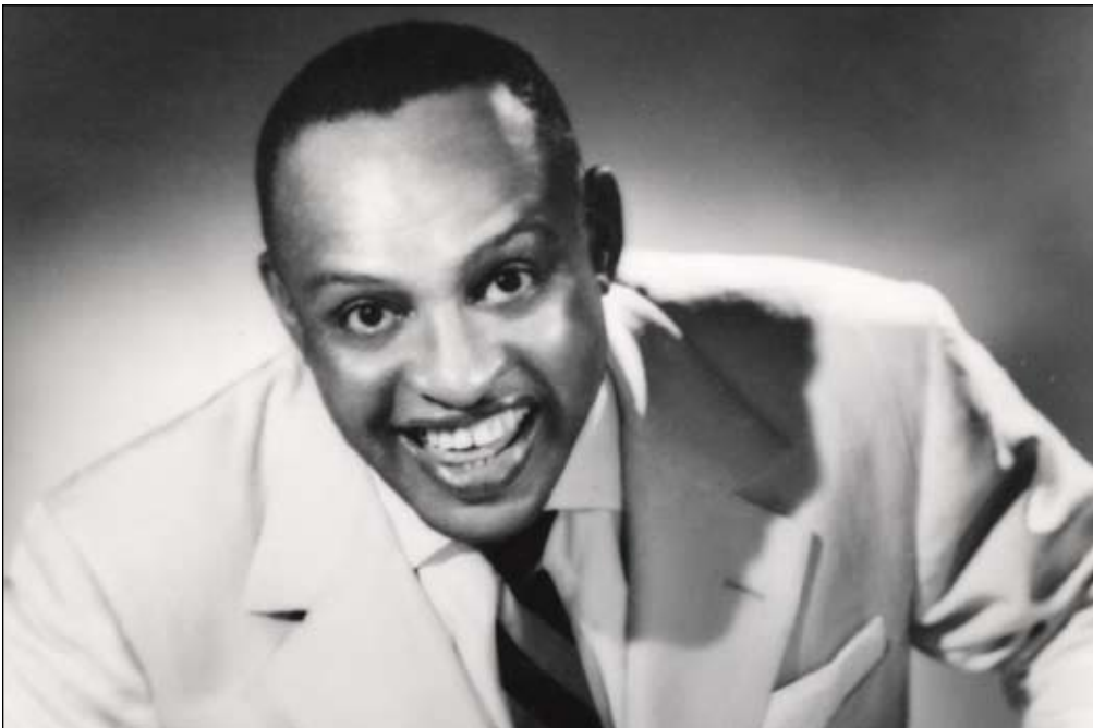
Lionel Hampton