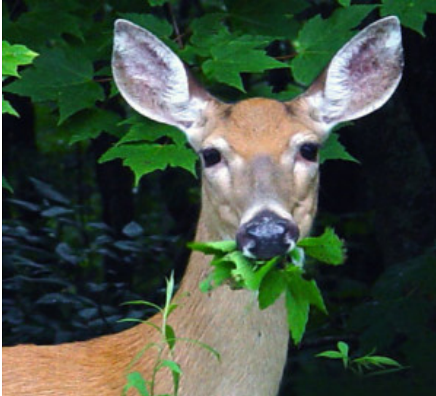
Whitetail deer eating leaves

Deer are herbivores. This means that deer do not eat meat, but instead eat plants and other vegetation.