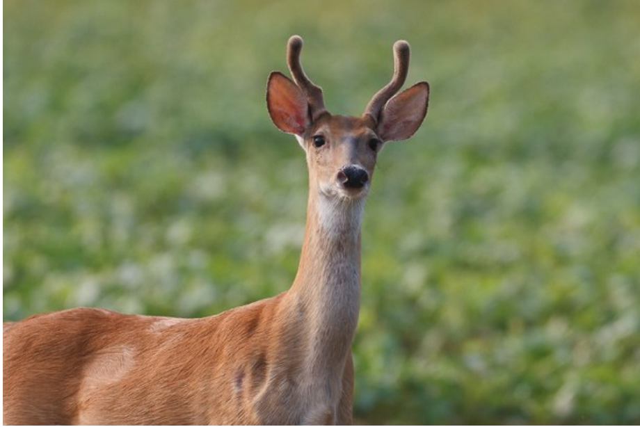
Buck growing antlers

In the spring the deer's antlers start growing back again for the next year!