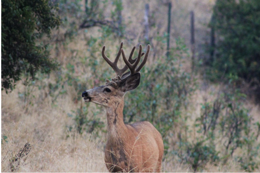
Mule deer buck

Mule deer bucks have antlers with forked beams.