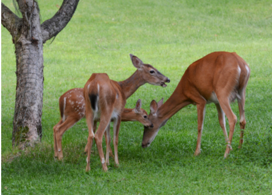
Deer feeding in a field

Due to the fact that deer are herbivores, they like to live in areas with lots of fields, shrubs and forests.