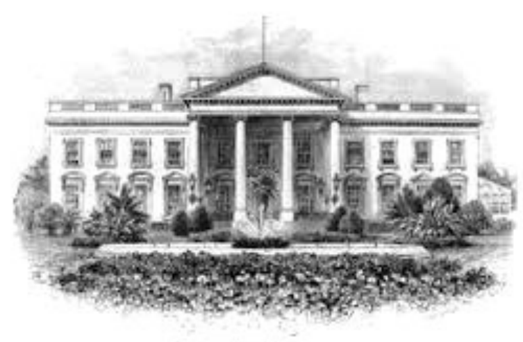
THE WHOLE HOUSE-STATE EXTRAPOR.

Well first of all, he was the first President of the United States! But more than just that, George Washington was also the leader of the United States Army during the Revolutionary War, and he helped write the Constitution!