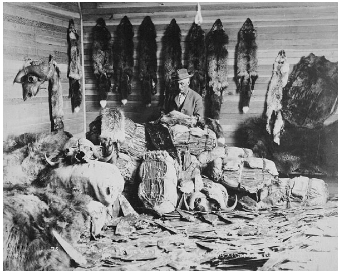
Late 1800s fur trader

Idaho's Fur Trappers were a group of men who came west to trap beavers to send back to the people living in the eastern United States. Many of the fur trappers were people who did not fit in with city life in the east. Some of the fur trappers were young men looking to 'make it big' while others were old men looking to get away from the busy cities and return to nature. A few were even outlaws looking to hide from the law on the edges of the world. Fur trapping was always part of the American Frontier because the population of fur animals dwindled quickly after the frontier was tamed. Most men who came west as fur trappers did not have wives. Rarely the trappers would take a Native woman to marry as their wives, but this was not common.