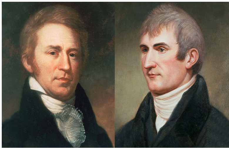
William Clark and Merriweather Lewis

The fur trapping has been part of life in America since before the American Revolution . French fur trappers had been working in the North East since before the first British colonies were founded. However, the Fur Trappers did not come to Idaho in large numbers until after the Lewis and Clark expedition. The expedition ended in 1806 but it took some time for the fur Trappers to come west. Lewis and Clark, however, paved the path west for the fur trappers to follow. The fur trade kicked off after the War of 1812 . The Rocky Mountain Fur Trading Company was founded in 1822 and controlled much of the fur trade until 1834 when the company went bankrupt. The fur trade continued well into the 1840s and 1850s. However, the declining beaver population meant that by 1845 large scale trapping was over.