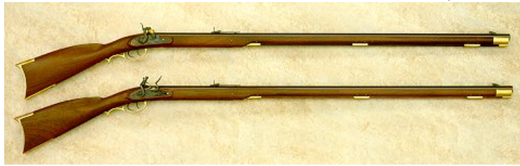
Top: Cap Lock Rifle, Bottom: Flint Lock Rifle

Every trapper also carried a flintlock or cap lock rifle or a musket both of which shot lead round balls . The difference between the two are few, but important. A musket has a smooth barrel that directs the ball toward a target. While a rifle has groves in its barrel that twist the ball as it leaves the gun. The advantage of the rifle was that it could be shot at a longer range than the musket. However, the musket had the advantage of being able to fire small pellets called shot . This allowed the musket to be used to hunt both large animals like deer and elk and small animals like rabbits and squirrels.