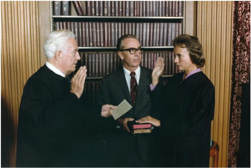
Sandra Day O'Connor getting sworn in as supreme court justice in 1981