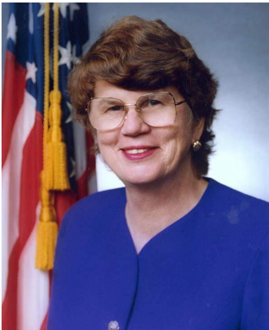
Janet Reno in 1993