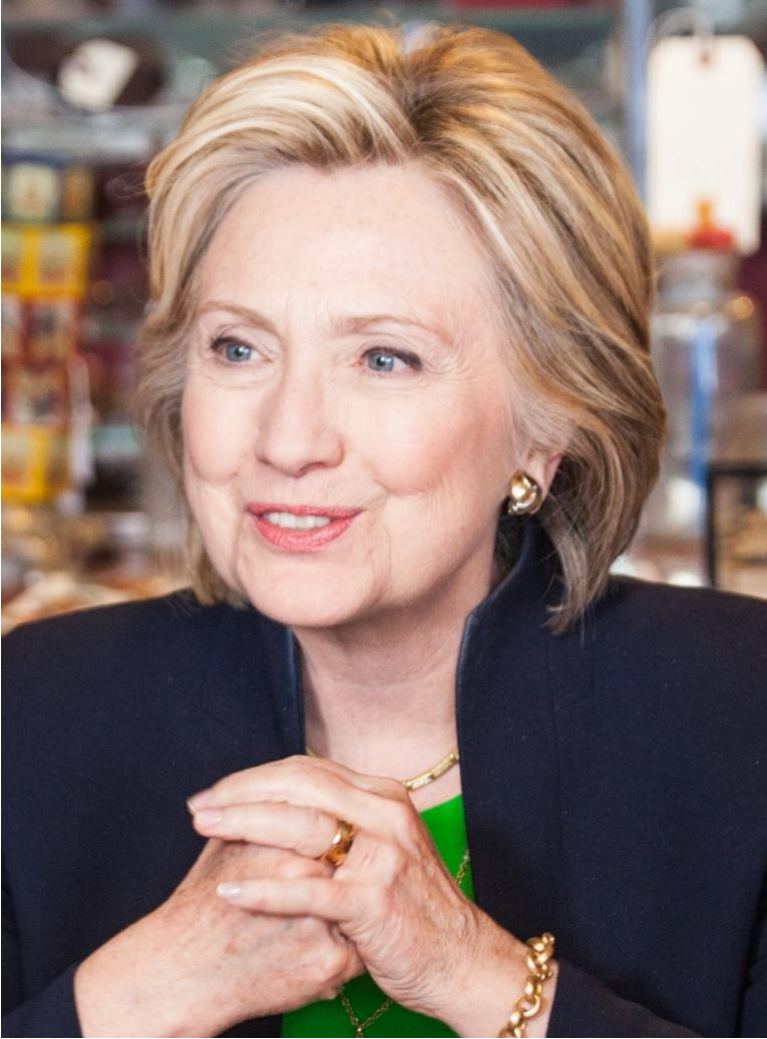
Hilary Clinton at an Iowa Coffee Shop, April 2015