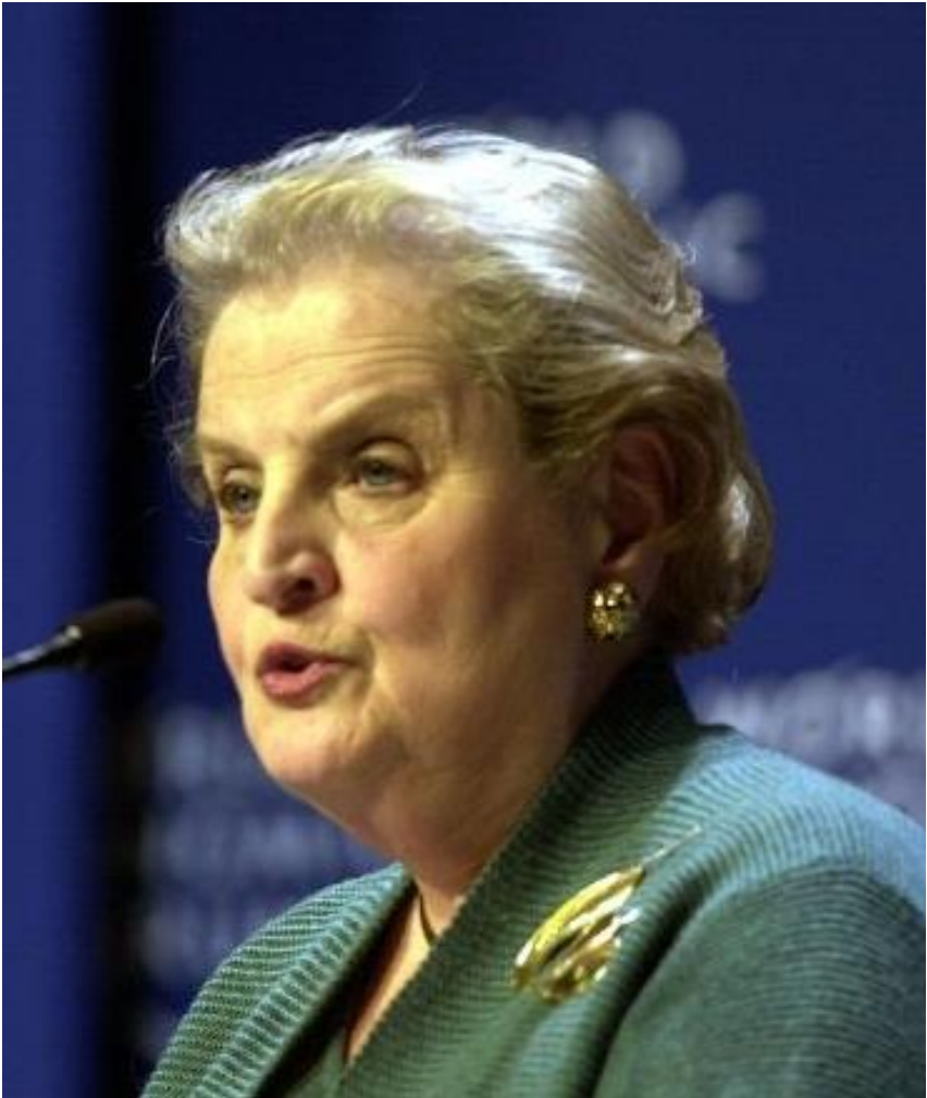
Former Secretary of State Madeleine Albright at the 2000 World Economic Forum in Switzerland