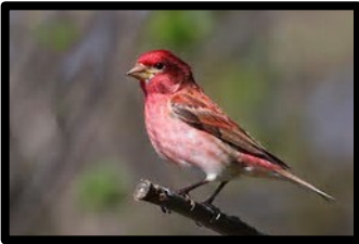
Bird: Purple Finch