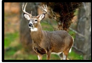
Animal: White- tailed Deer