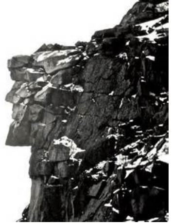
“The Old Man of the Mountain”