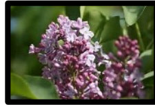
Flowers: Purple Lilac & Purple Lady Slipper