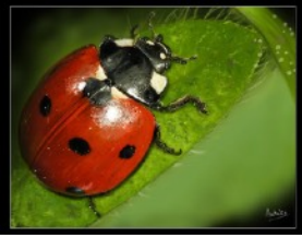
Insect: Lady Bug