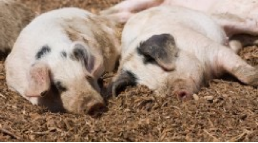
Pigs bathing in the sun

Pigs are raised all over the world! They provide many valuable resources for humans including lard , leather, medicines, and of course, food.