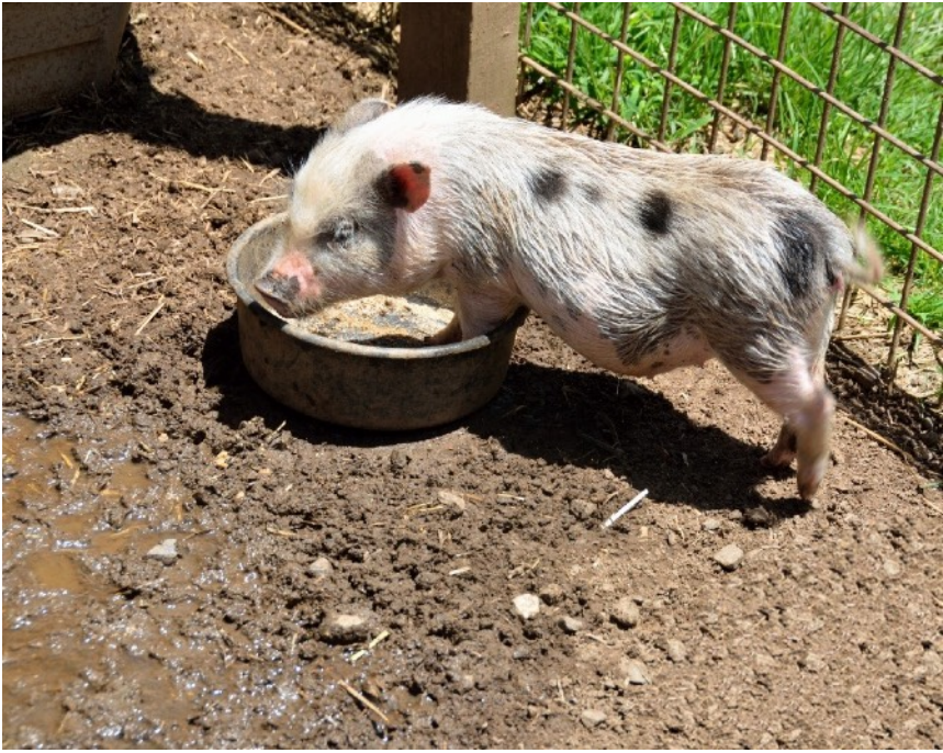
Domestic pig eating grain on the farm

Domesticated pigs and wild pigs have different diets. The wild pigs eat leaves, roots, fruit, and other small animals while the domesticated pigs eat mostly corn or grain based dinners.