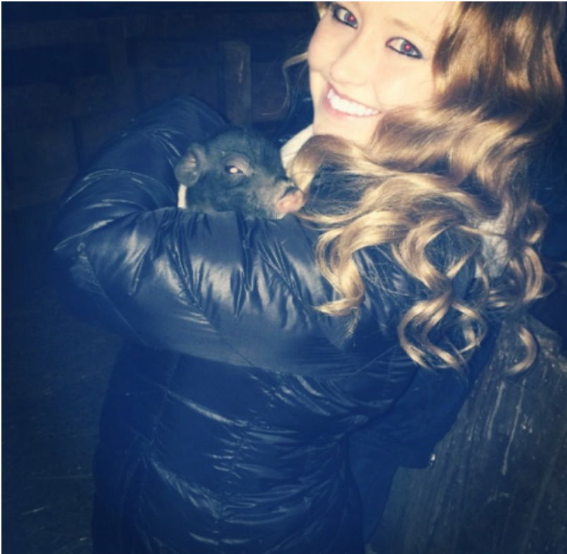
The author holding a new baby pig

My favorite part! When a sow has babies, she gives birth to a litter of young called piglets . A sow can give birth to anywhere from 7-12 babies twice a year. When they are born, piglets weight about 2.5 pounds, until they are full grown and can reach up to 500-700 pounds, some even bigger!