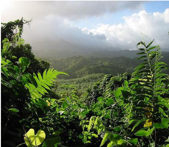
This is just one view from a ridge of the Waimea Valley on Oahu, HI.

Oahu is home to the densely populated capital