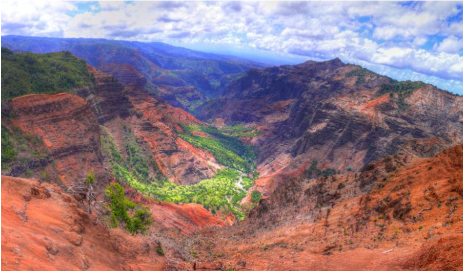
This photograph was taken by Tlpo Charsky of Waimea Canyon in Kauai, HI on August 28 th , 2010.

important to each island, Maui is striving to improve reef life around the island. A reef is a ridge under the ocean most of the time that is full of rocks, coral, and sea life. The most well-known reef in Maui is Molokini Crater. This islet is unique as it is made up of volcanic rock and sits above and below the sea. Many colorful fish swim in and out of the crater's hiding places, and the top of the islet is left as a sanctuary for the seabirds of Maui.