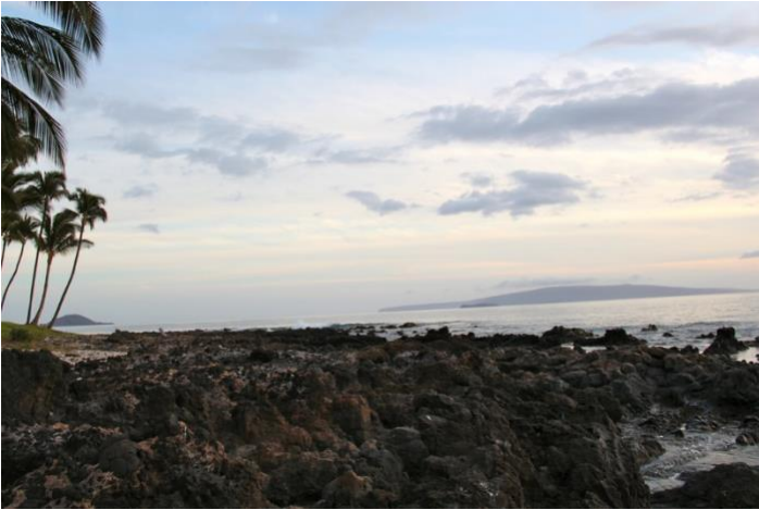
The shores of Kaho'olawe.

Before the natives of Hawaii and a preserve commission took back Kaho'olawe, the island underwent a long history of abuse. The island has been inhabited for thousands of years and was used as a place for agriculture and