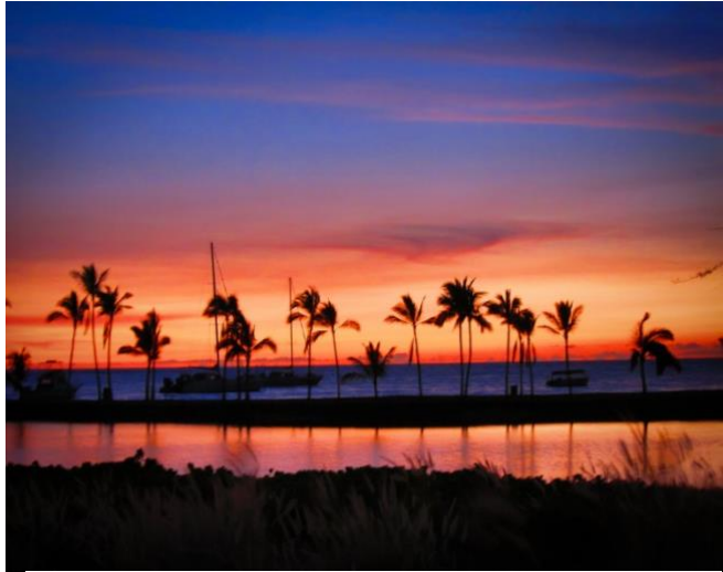
This photograph was taken at sunset on the Big Island.

Hawaii is the largest island amongst the Hawaiian Islands. There are two active volcanoes on the island which provide the people who live there