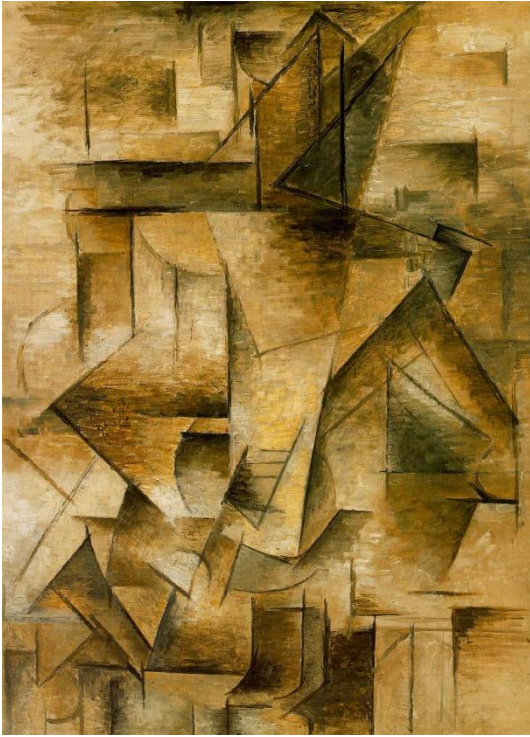
Pablo Picasso's Le guitarist (1910). Musée National d'Art Moderne, Centre Georges Pompidou, Paris. enlarge

areas of paint to emphasize this plural viewpoint.