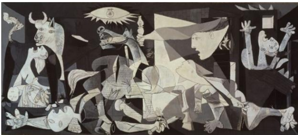
Picasso's Guernica (1937). Museo Reina Sofia, Madrid