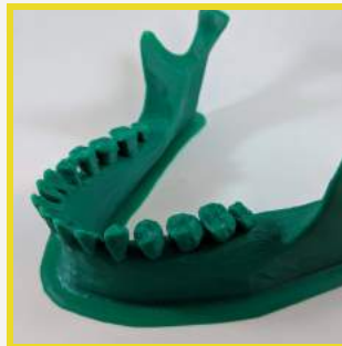
3D printed mandible