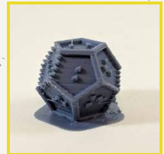
3D printed braille die.