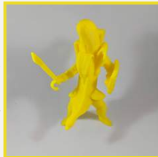
3D printed Banana Knight

In support of Vandal Giving Day, the MILL will have multiple activities scheduled over April 2nd and 3rd.