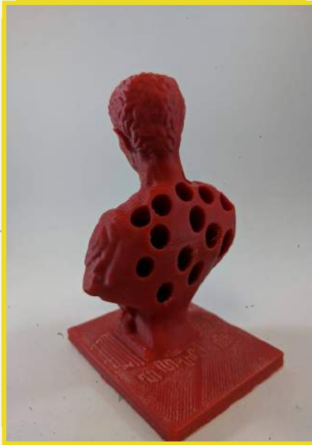
3D printed Julius Caesar pen holder