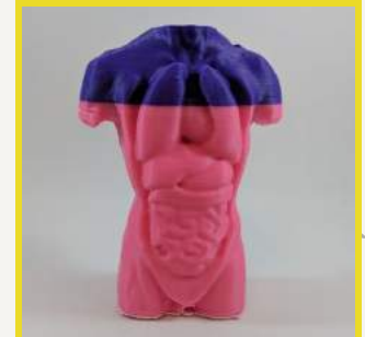
3D printed body model