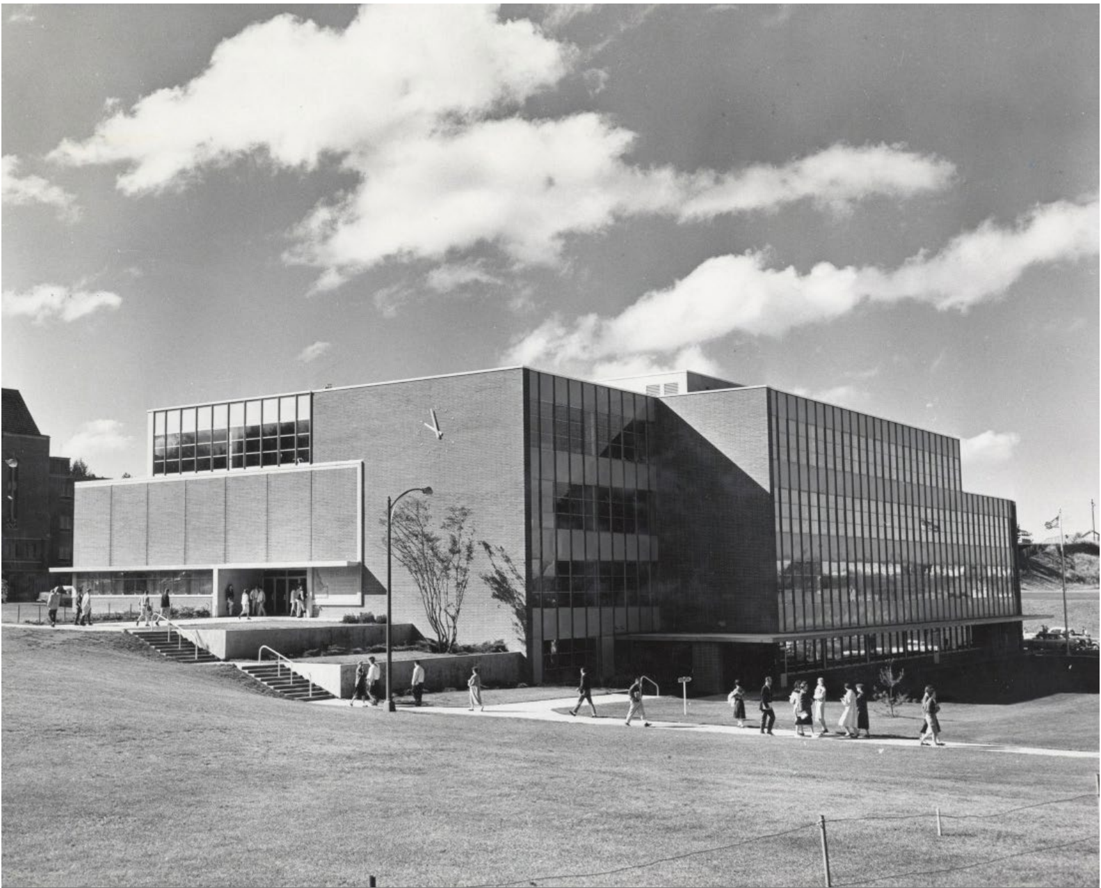
“1957 photograph of the Library. Students in the foreground. [PG1_122-001],”