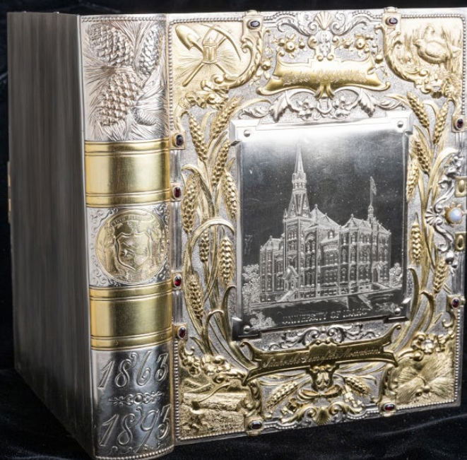
“Photograph of Silver and Gold Book standing on edge, University of Idaho Library Digital Collections.