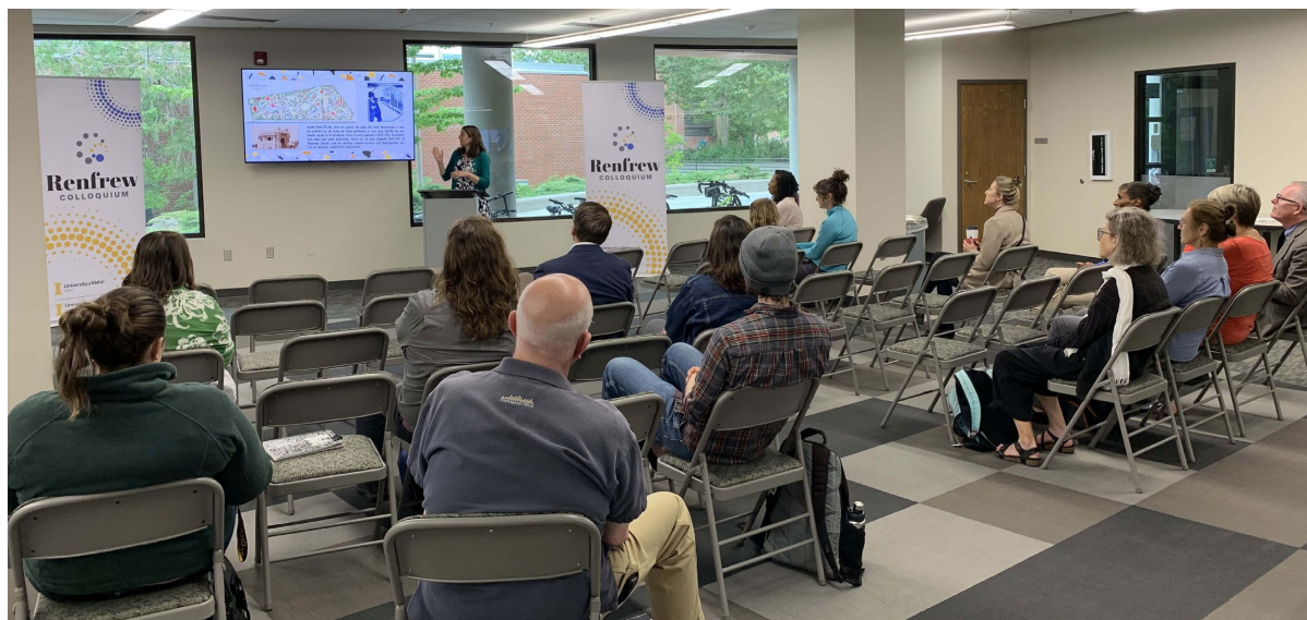
The first Renfrew Colloquium of Fall 2024

Center for Digital Inquiry & Learning . This center has been a cornerstone of our efforts in digital scholarship and humanities, showcasing the combined strengths of our two units in service to the University of Idaho community.