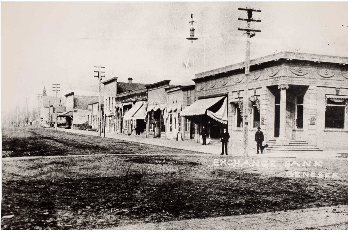
Genesee Exchange Bank, circa 1910.

While farming drove the development of southern Latah County, it was timber that built communities like Potlatch and Deary. Potlatch's City Hall is an enduring piece of that history. The Potlatch Lumber Company constructed the building in 1917 as its Administrative Building. From those offices, company leaders oversaw the many services offered in a company town, including the hospital, general store, fire department, and employee housing. There are other notable company assets profiled in the collection, like the Worker's Neighborhood, Nob Hill houses, and the Gymnasium.